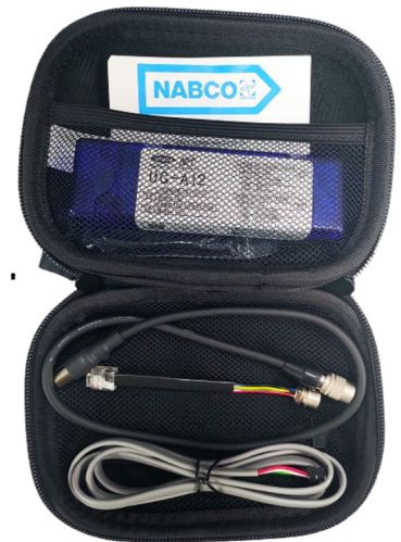
NET-HT-Handy Terminal Kit P/N A-01433 (Android Device Required)