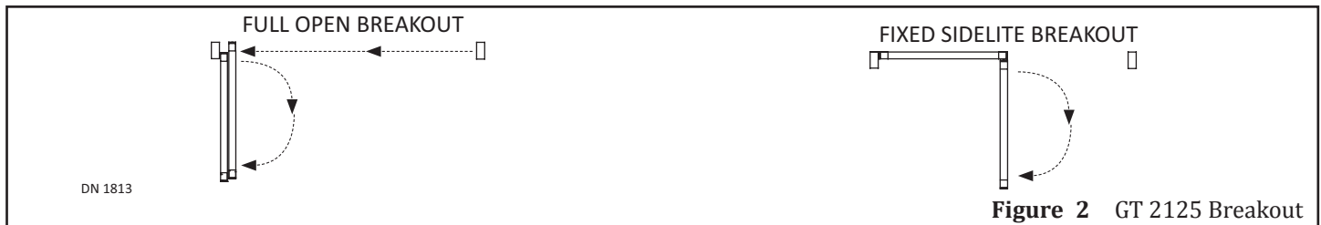
Figure 2 GT 2125 Breakout